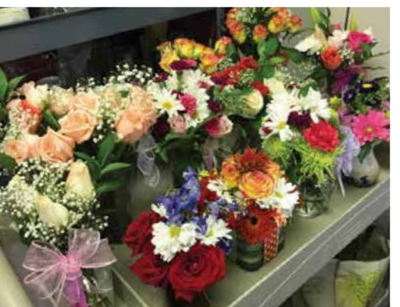
A tray of bouquets prepared by the Grand Rapids "Flower Ladies" is ready for delivery.

Since its beginning in Grand Rapids just over 12 years ago, the Grand Rapids "Flower Ladies" have created more than 27,000 bouquets, bringing smiles to patients on our service across West Michigan.