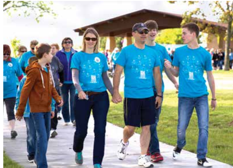
Families came together for Alpena's second annual Walk & Remember to remember their loved ones.