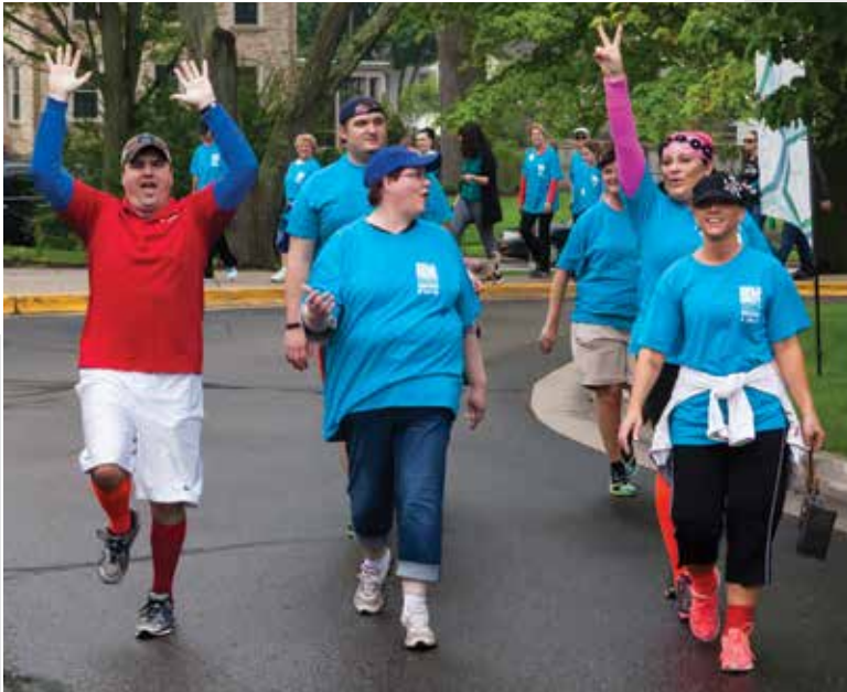
A good time was had by all at the Grand Rapids Walk & Remember.